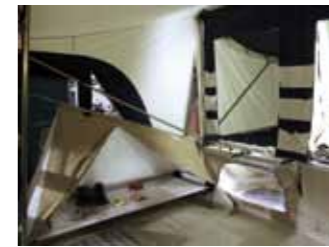
Organizer, extra sleeping cabin, groundsheet