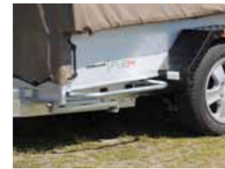
Bullbars, aluminium wheels, black wheel cases