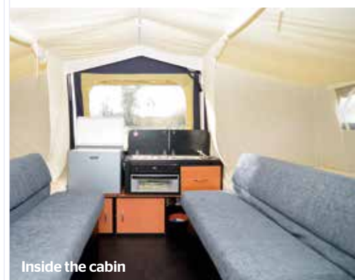
Inside the cabin