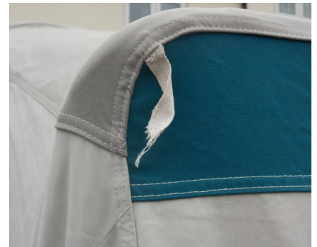
Missing O rings can be easy to miss, but are fiddly to replace.

It should be held on mostly by bungee cords, but, in the centre, at each end, it should be held firmly in place by three screws.